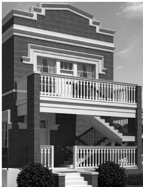
Easton's Health Clinic will open on campus in 2009.

3019 Canal Street in 1913 when its name was changed to Warren Easton Boys High. The school became coed in 1952 and integrated in 1967. The Louisiana landmark took on eight feet of water in Hurricane Katrina and was closed for one school year. Easton reopened in 2006 as a charter school operated by a group of alumni.